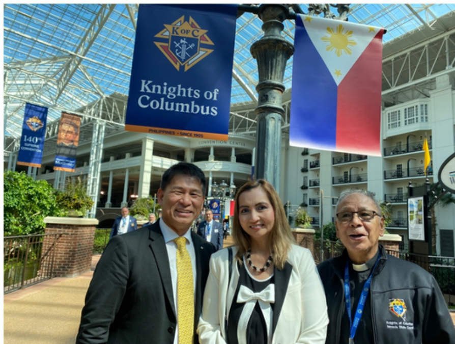
At Gaylord Opryland Convention Center