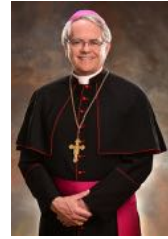
Third Bishop of Las Vegas

We are excited to announce that the Annual Diocesan Conference registration website is live.