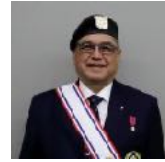
District Deputy #12