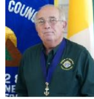
Grand Knight Council #4928