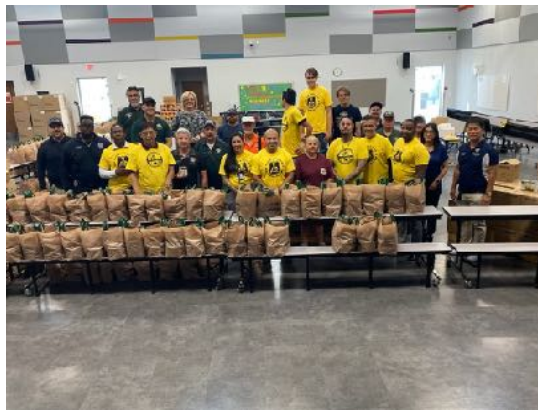
Volunteers from SNPAL and Councils 2828, 9102, 14784 and 17996

We had a fantastic turnout at the Jo Mackey Elementary School on August 31. The school is a K-8 magnet school in North Las Vegas. They are part of the iLead Academy team with a focus on Digital Sciences. We'll have another event in a month or so - please come out & help; I know that you'll find it worthwhile.