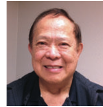
State Program Director