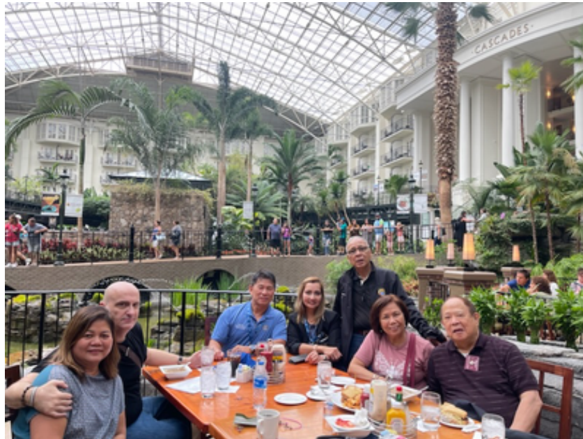
Luncheon at Gaylord Opryland