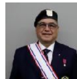
District Deputy #12