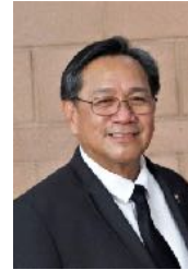
Grand Knight Council #9102

On Friday, September 9th at 12:00PM to 6:00PM the Wreaths Across America Mobile Education Exhibit will be at Ou Lady of Las Vegas.