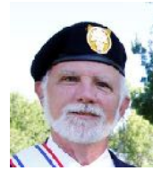
4th Degree District Master

We will be having a Fourth Degree Exemplification on Saturday, October 1, 2022 at Our Lady of Las Vegas.